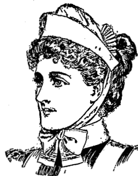
The New "Sister Dora" Cap. Made of washing Cambric, with draw strings. Can be washed as easily as a handkerchief. 1/-. Without strings, 10½d.