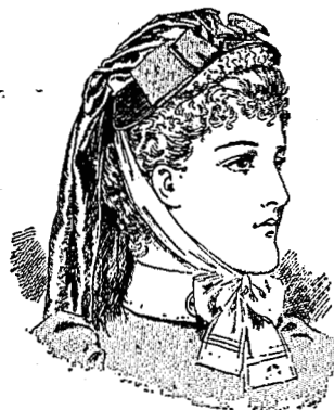
The "St. Bride's" Bonnet. Made of fine Straw with Lace and ruching, and trimmed with Ribbon, and long Silk Gossamer Fall. In black and colours, 12/6 each. Without Fall, 9/6; also The "St. Clare" Bonnet. 6/11 complete.