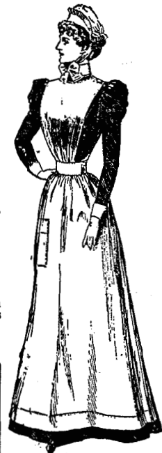
The "Rena" Apron. Made of linen finished Cloth lock-stitch throughout, 2/6 each. In two sizes, 35 in. & 39 in. from waist to hem.